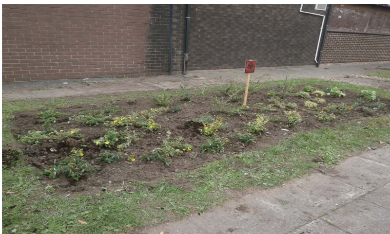
Fig. 4. a meanwhile site complete with signage by the Pendleton Guerrillas.

gardeners surveyed revealed how they intended to apply for permission to grow their activities and, like so many other groups, seize on funding for their projects.