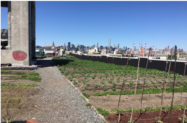
Fig. 1. The world's largest rooftop urban farm in Brooklyn, New York City, USA (Hardman, 2013).

In terms of exemplars of UA practice, Fig. 1 depicts a large-scale form of the activity, in this case Brooklyn Grange Rooftop Farm in New York City, USA. The figure highlights the potential for UA and how the practice can involve projects which employ gardeners and operate as a business, with the project shown in the figure growing some 50,000lbs of vegetables each year (Brooklyn Grange Rooftop Farm, n.d.). This large-scale form of activity is growing, with companies such as Gotham Greens (2016) starting new UA projects across North America and employing more people within the sector. Within the UK there is a rise in this large-scale form of the practice, with aqua farms, hydroponic, rooftop and conventional urban farms appearing more and more (see for instance Sustainable Food Cities, 2017).