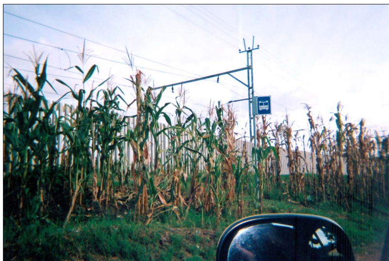
Fig. 3. guerrilla gardening at a bus stop in Umlazi ( Chipungu et al., 2015 ).

With regard to the informal movement, most of the UA practiced falls within this definition. The practice of guerrilla gardening in the Umlazi area is a common phenomenon on road verges, where